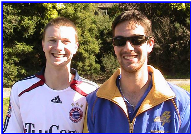
Our coaches after a loss. You should see them when we win!