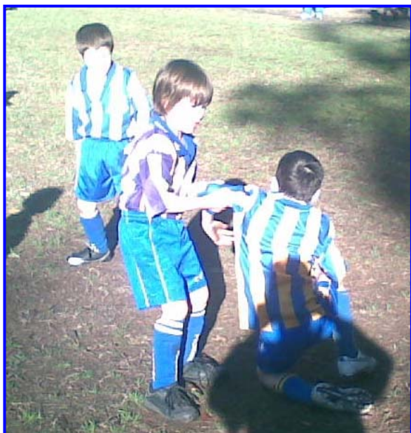
Thunder Spirit in Action – Helping a Team Mate