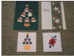
Christmas Punch Cards