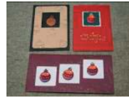
2 Step Stamping