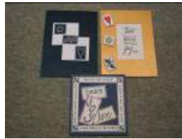
Christmas Folding Fun